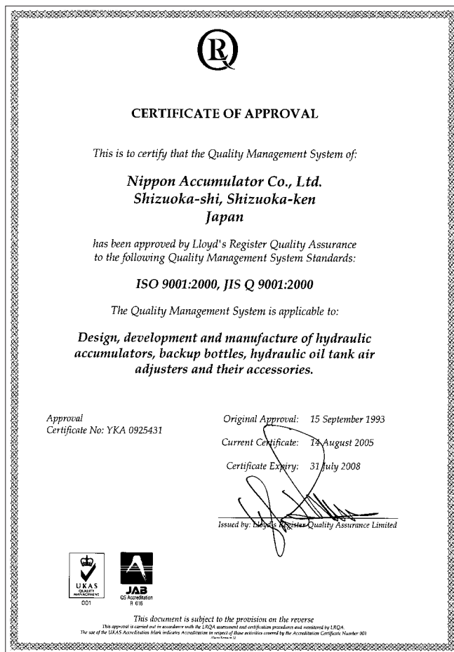
ISO 9001 Certificate

The approval coverage of each certificate as of November, 2006 is as follows;