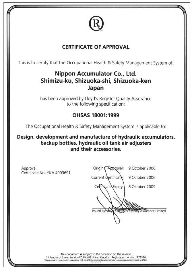
OHSAS 18001 Certificate